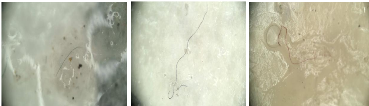
Figure 2: Different types of microplastics observed under the Stereomicroscope

All the fish samples across the three rivers contained microplastics. The fish samples from Buriganga exhibited the highest microplastic concentrations, with 28, 20, and 24 MPs recorded in October, November, and December, respectively. Dhaleshwari followed this with 16, 7, and 9 MPs, and Meghna with 12, 8, and 5 MPs. These data indicate a distinct contamination gradient, aligned with the urbanization levels of the rivers.