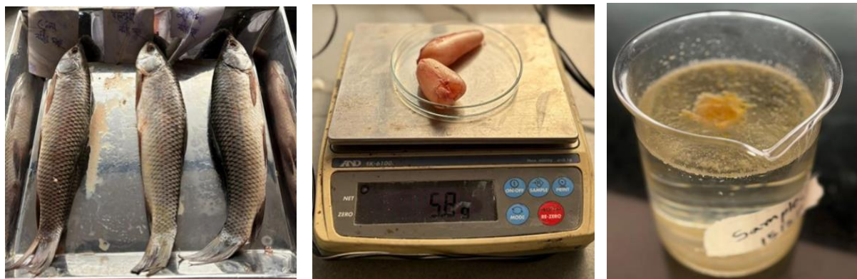
Figure 1: Dissection of the gastrointestinal tract and digestion of organic matter with 30% hydrogen peroxide ( \text{H}_2\text{O}_2 )

river to ensure the post-monsoon phase was captured over time. The fish samples were frozen and transported to the lab, where they were maintained at -20^{\circ}\text{C} until further analysis.